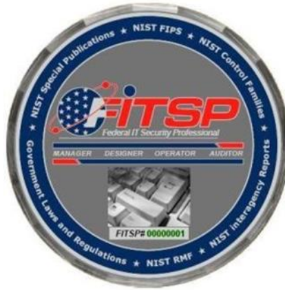
Figure 3: Example of a FITSP Challenge Coin