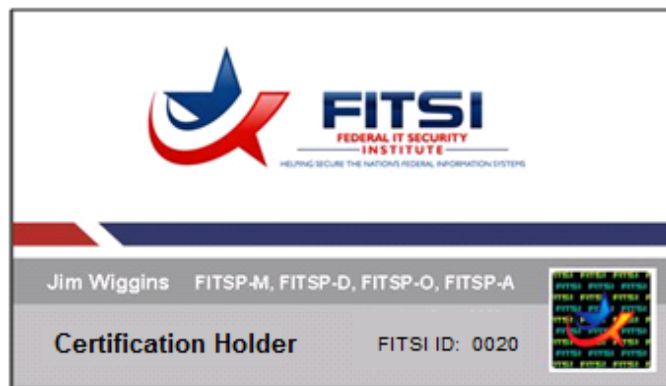
Figure 2: Example of a FITSI ID/Certification Card