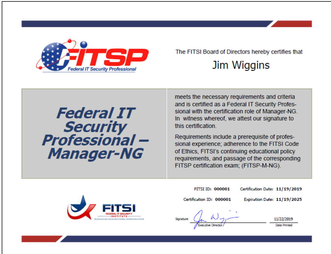
Figure 1: Example of a FITSP-Manager-NG Certification