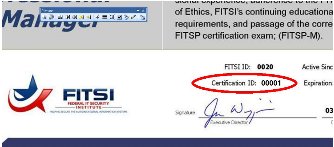
Figure 1: Certification ID Number Location

The certification holder's last name and certification identification (ID) number are needed to verify the certification holder's status. The certification ID number is located on the certification holder's certificate as indicated in Figure 1 below.